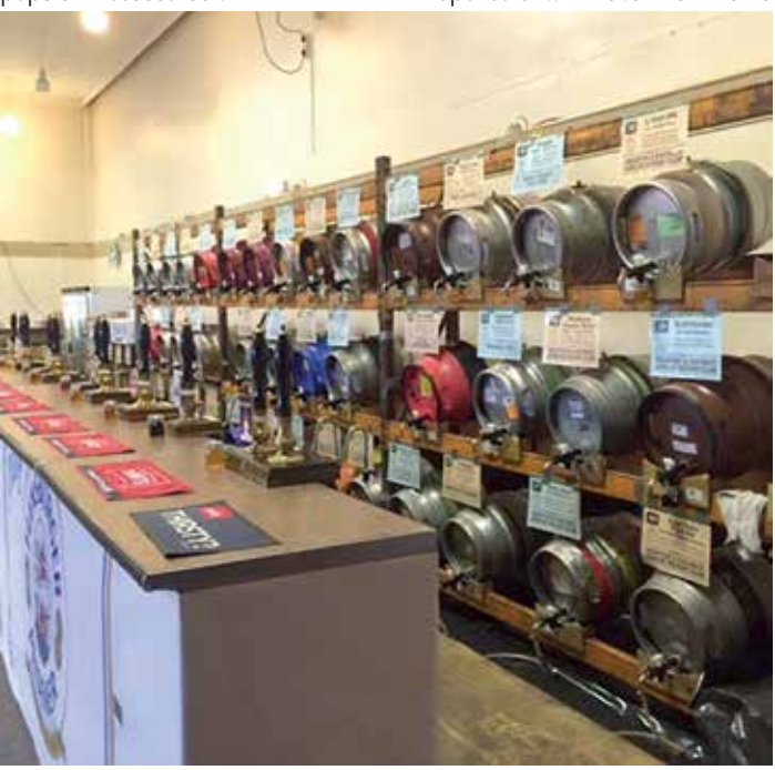
The bar "ready to go"

displayed on a cask, get a mention in the programme and will receive four entry tickets, each with a commemorative pint glass and two half pint drink tokens.