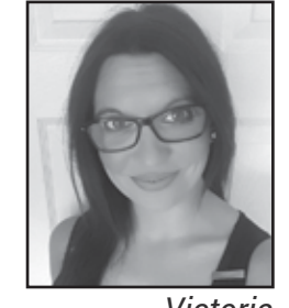
Head of Courtyard Homes