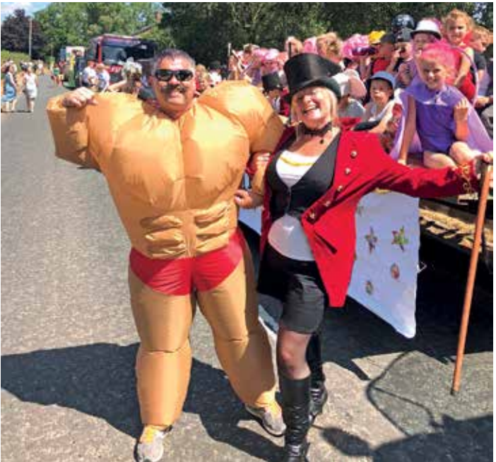
The Croft Primary float.