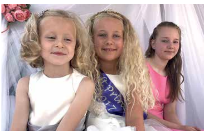
More pictures and video online at www.warrington-worldwide.co.uk