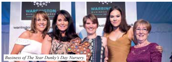
Business of The Year Dunky's Day Nursery.