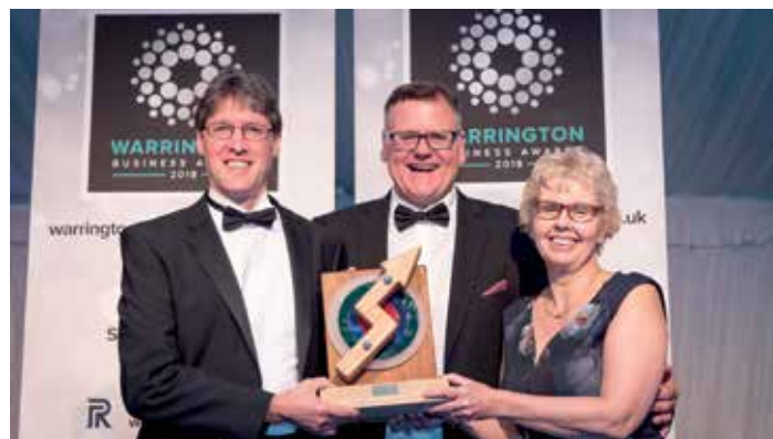
Retailer of the Year Pets Pantry.