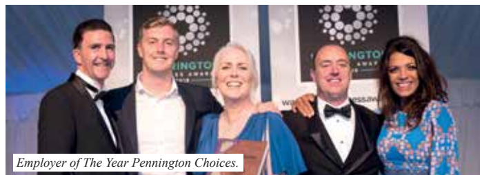
Employer of The Year Pennington Choices.