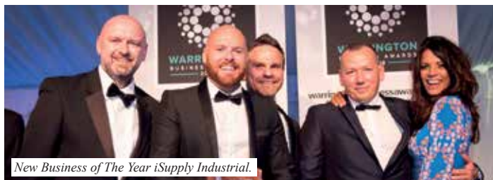
New Business of The Year iSupply Industrial.