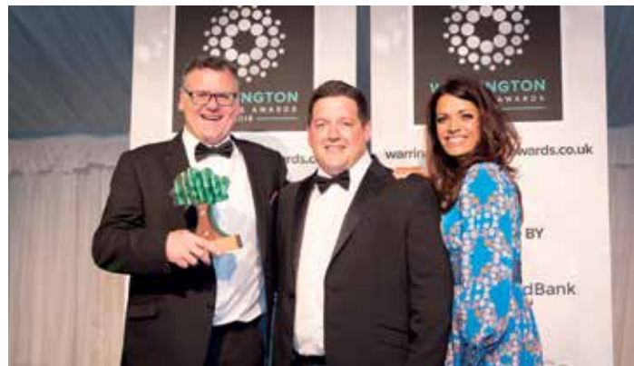
Green Award winners Golden Square.