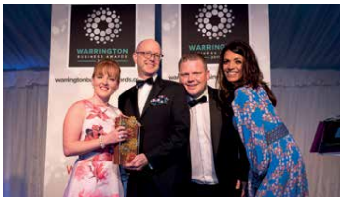
Hospitality winners Room 40.