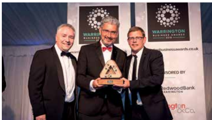
Community Award winners Wolves Foundation.