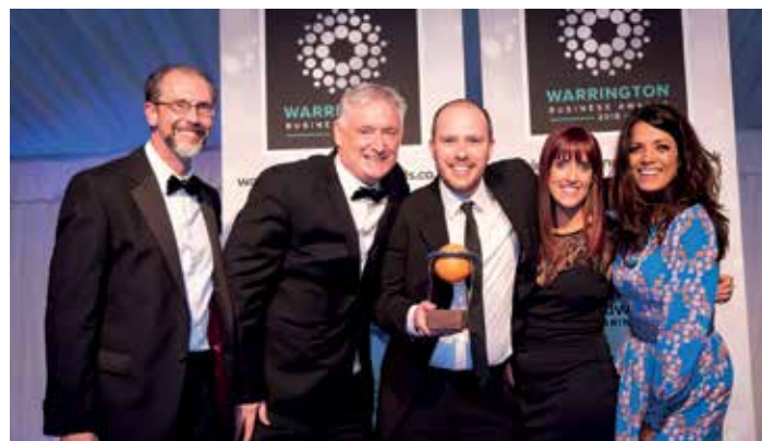
Innovation of the Year 8K Flexwarm.