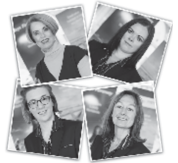
■ Stockton Heath Hays Travel Team.

Most of all Sani is a place where you can relax, rejuvenate and simply have fun with family and friends.