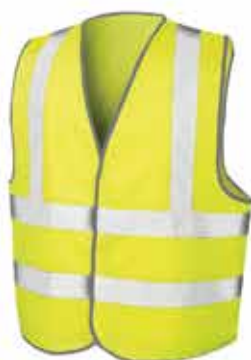
HI VIZ VEST