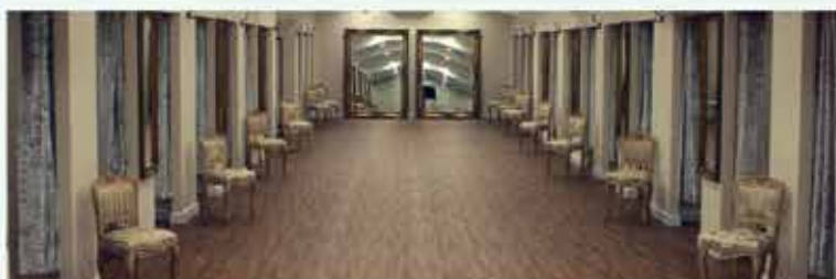
Dresses from The Dress Studio