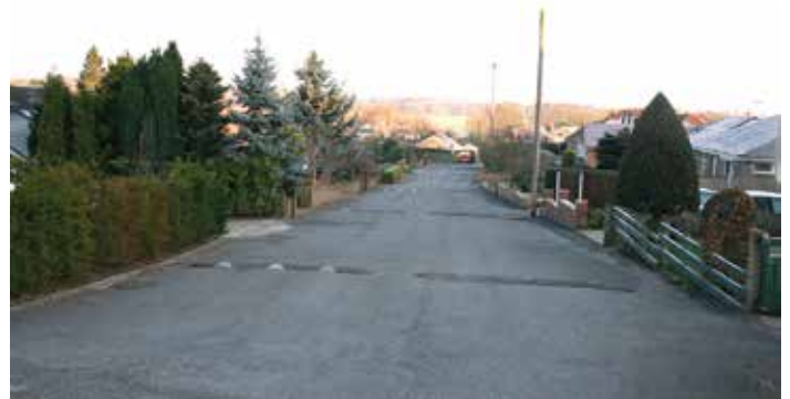
Danebank Road, Lymm, scene of the fall.

FREE Market Valuation | Listing on Rightmove, Zoopla and Primelocation | Full Sales Progression.