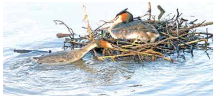
One of Roy's photographs of the two Grebes.

A LYMM couple have spent several weeks watching a pair of Great Crested Grebes as they made their nest, laid four eggs and then sat on them keeping warm their precious potential next generation.