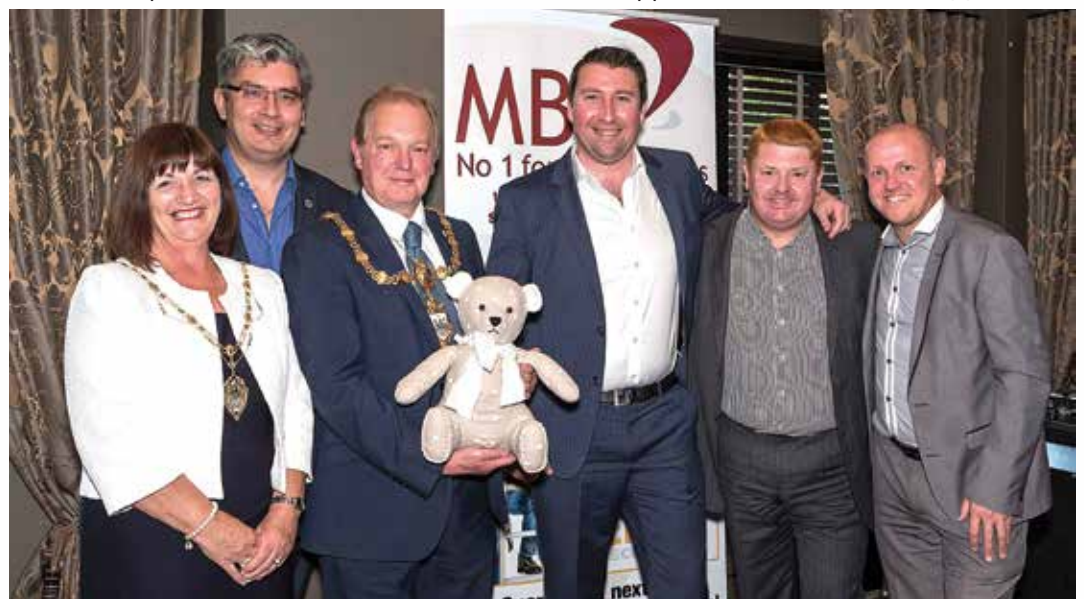
Warrington Branch: 1 Dallam Lane, Warrington, WA2 7LR Tel: 01925 653620