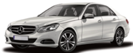
Mercedes-Benz E Class E220 CDI SE Auto £193.48 + VAT per month 9+23 BCH 10k miles a year