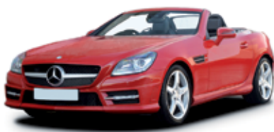
Mercedes-Benz SLK 250 CDI AMG SPORT £199 + VAT per month 9+23 BCH 10k miles a year