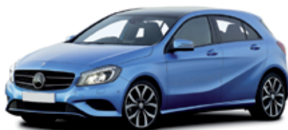
Mercedes-Benz A Class A180 CDI SE Hatchback £188.56 + VAT per month 9+23 PCH 10k miles a year