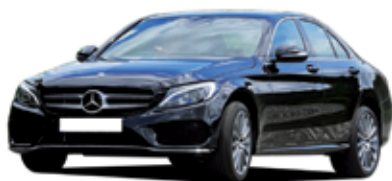
Mercedes-Benz C Class C200 SE Saloon £203.69 + VAT per month 9+23 BCH 10k miles a year