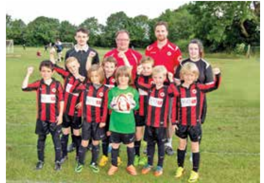
Celebrating the event are Frodsham Town One under 8s and Frodsham Park under 7s with organisers and referees.