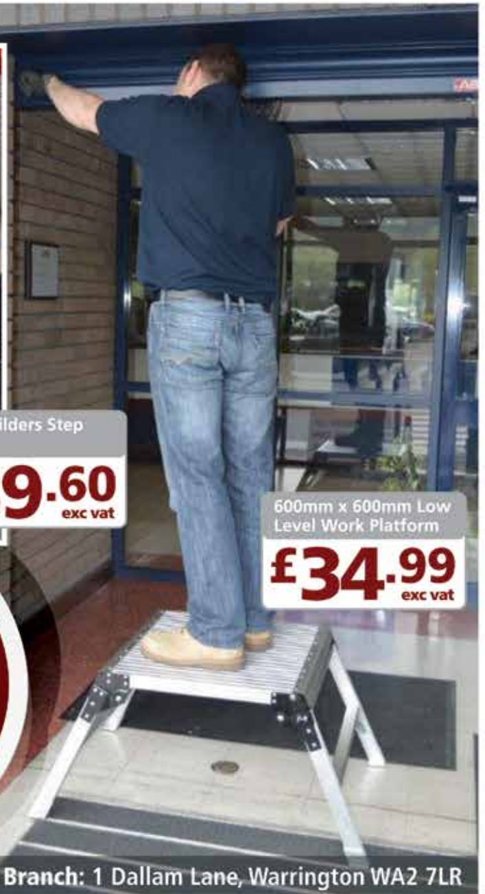
600mm x 600mm Low Level Work Platform