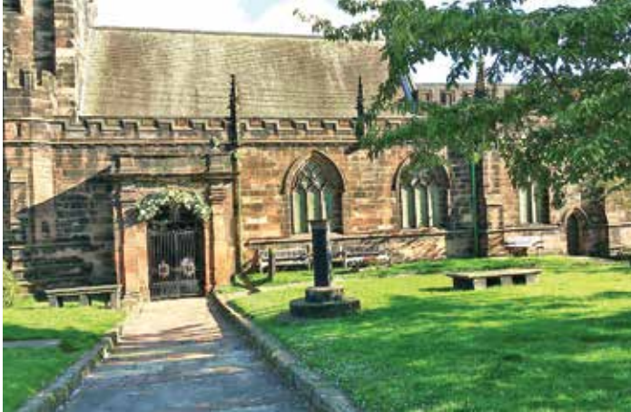
St Laurence Church – with the bare plinth.

FRODSHAM Town Council's World War One commemoration working group is researching designs for a sundial to replace one stolen from St Laurence Church several years ago.