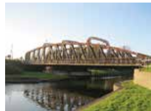
Before and after the £4.5m upgrade at the Swing Bridge.