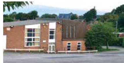
Community Centre heating system.