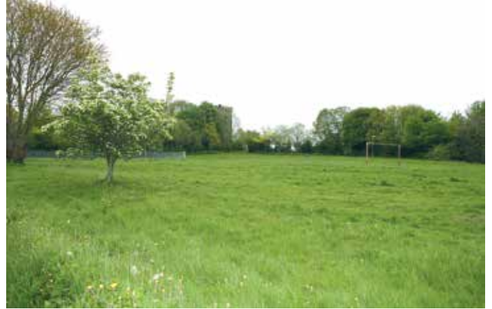
Churchfields...waiting for redevelopment.

The council stressed at the time that no firm plan had been adopted and that the proposals were merely part of a consultation process.