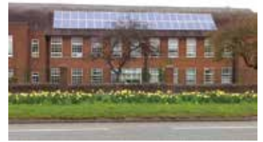
Solar panels at Helsby High