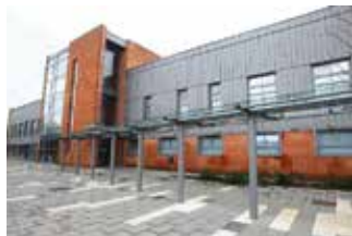
A new medical centre next door to the upgraded library.