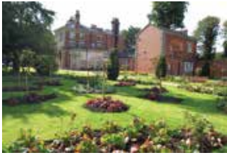
Frodsham has welcomed small businesses to Castle Park House and a major refurbishment of the park and open spaces.