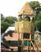
New play facilities in Castle Park and Ship Street for children.