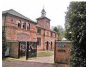
Grants to the Arts Centre for gallery refurb & toilets.