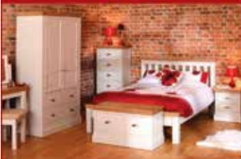
Tatton Painted Bedroom with Oak Tops