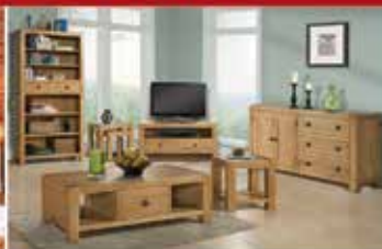
Eaton Oak Living Room & Occasional