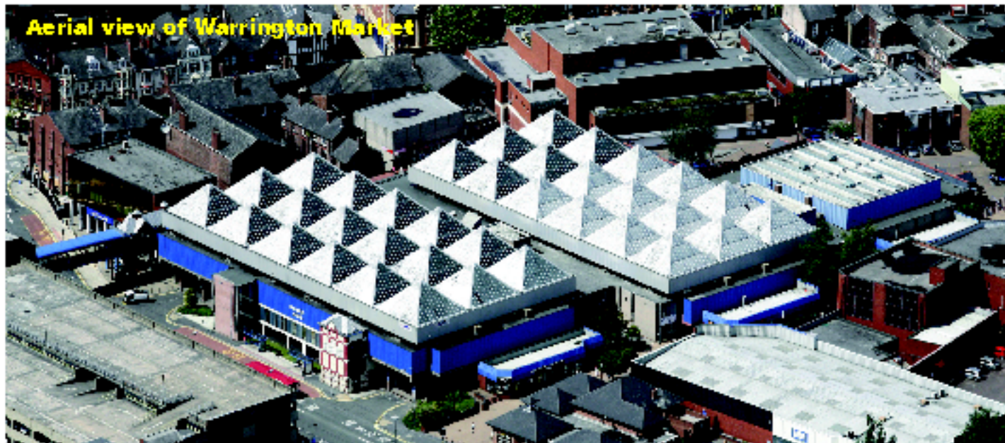
Aerial view of Warrington Market

Following the success of the first programme in 2006, which has helped many budding entrepreneurs to launch and sustain businesses at Warrington Market, the council has decided to run a similar scheme offering even more exciting opportunities to start-up businesses.