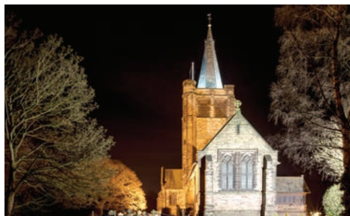
■ St John's Church, Walton.

A selection of his work can also be seen on my Flickr site at: www.flickr.com/photos/photosensitive6