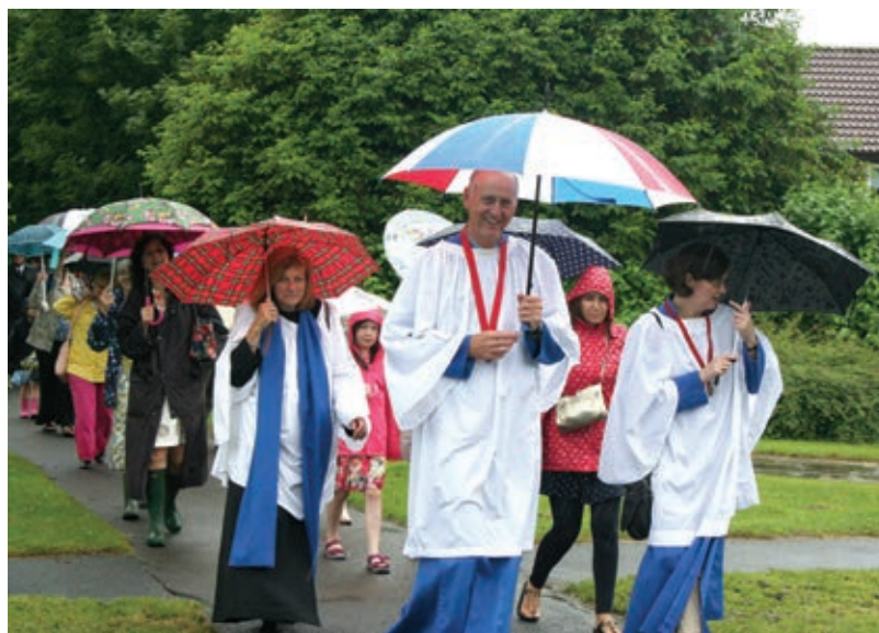
Walkers brave the rain.