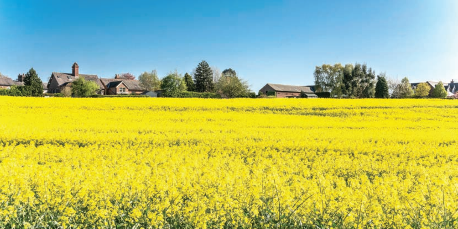
■ Summer shot in Grappenhall.