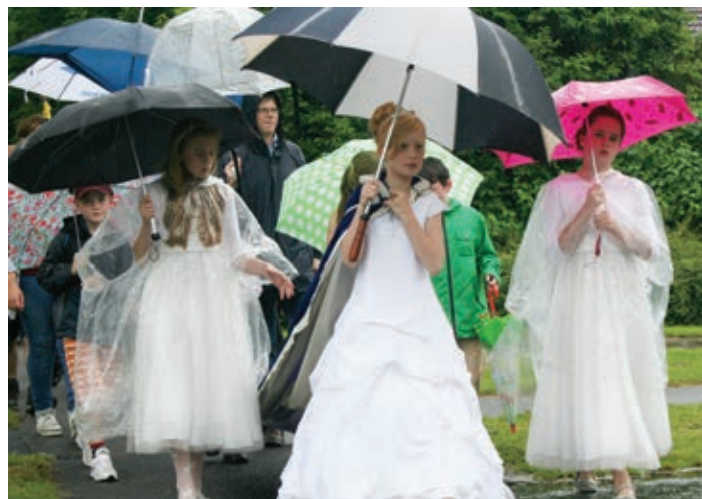
Walkers brave the rain.