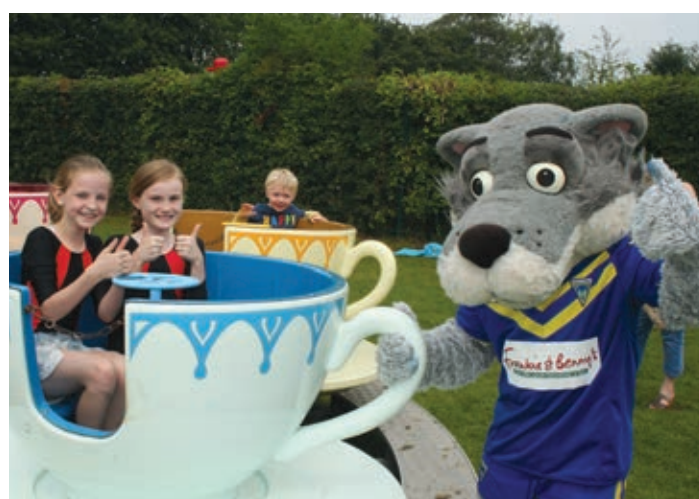
Wolfie entertains youngsters at the school