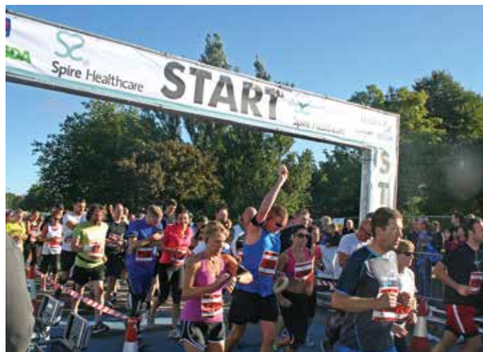
Record numbers entered the English Half Marathon

Meanwhile next year's English Half Marathon event has been provisionally arranged for Sunday September 7.