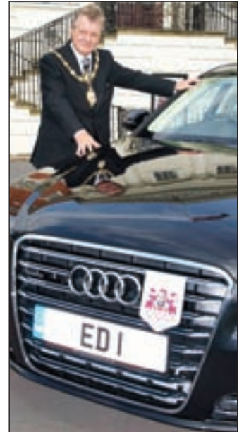
The Mayor and with the new car outside the Town Hall.

"Trading the older car which was more expensive to run, for a more economical, greener option is just one of the ways that the council is making savings."