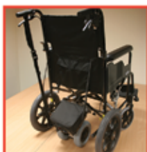
WHEELCHAIR POWER PACK WITH FREE WHEELCHAIR