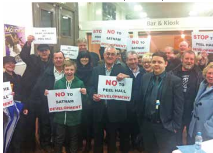
Protestors at the Parr Hall hearing last year.

The plan was eventually thrown out by a Government appointed inspector last July.