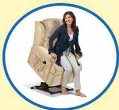
Rise & Recliner Chairs From £499