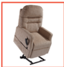
LILBURN RISE & RECLINE CHAIR