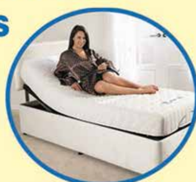
Adjustable Beds From £549