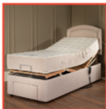
PRISCILLA ADJUSTABLE BED