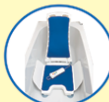
Bath Rasiers From £299