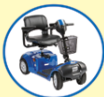
New Scooters From £419