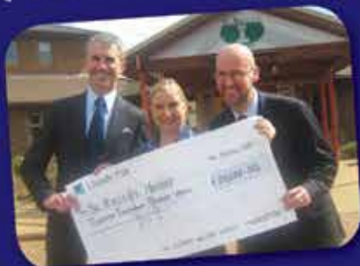
The Clanion Welsby Foundation awarded a grant of £20,000 towards service developments at St Rocco's