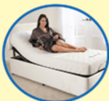
Adjustable Beds From £549