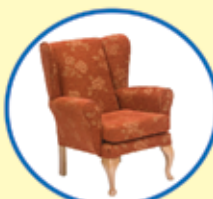
High Back Chairs Fabric From £245 Vinyl From £119