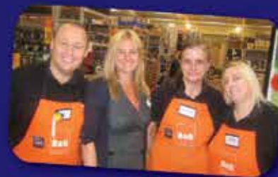
A huge thanks to staff at B&Q Warrington! A team of staff from the store brought plants and materials and spent the day at Rocco's revamping the Day Therapy gardens. You really helped to make a difference!