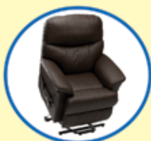
Rise & Recliner Chairs From £499