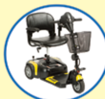
Refurbished Scooters From £199