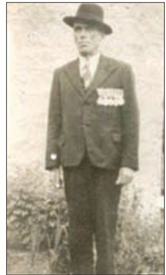
possessing the most extraordinary natural talent for descriptive writing.

"Yet, perhaps the most remarkable aspect of all is the fact they are written by a professional private soldier