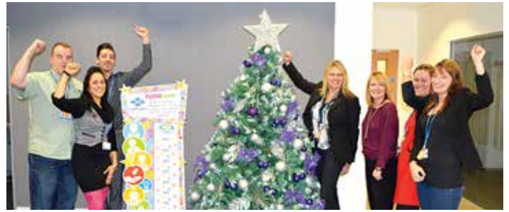
Christmas Cheer for GGHT's Employment Initiatives Team celebrating their success of supporting 42 residents into work during the month of November.

WARRINGTON based Golden Gates Housing Trust's (GGHT) Employment Team have been helping to deliver the gift of a new job in time for Christmas, after successfully supporting 42 of its residents into work during the month of November.