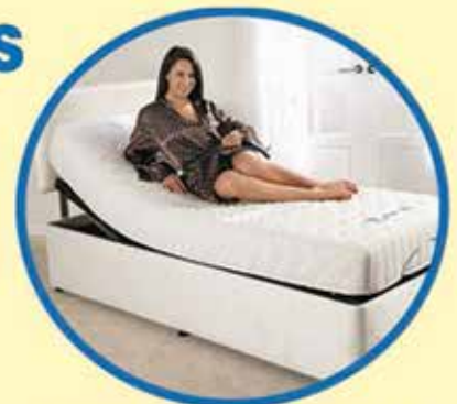
Adjustable Beds From £549