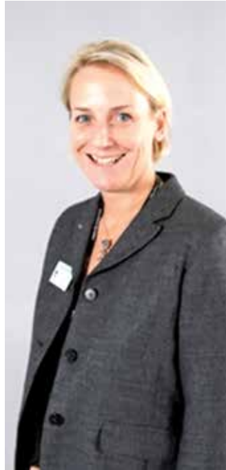
local community will make her an excellent Principal.

"Her passion for teaching and learning and the success of all learners linked to the needs of the