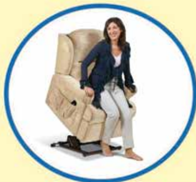
Rise & Recliner Chairs From £499