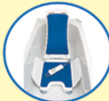
Bath Rasiers From £299