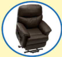
Rise & Recliner Chairs From £499