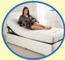
Adjustable Beds From £549