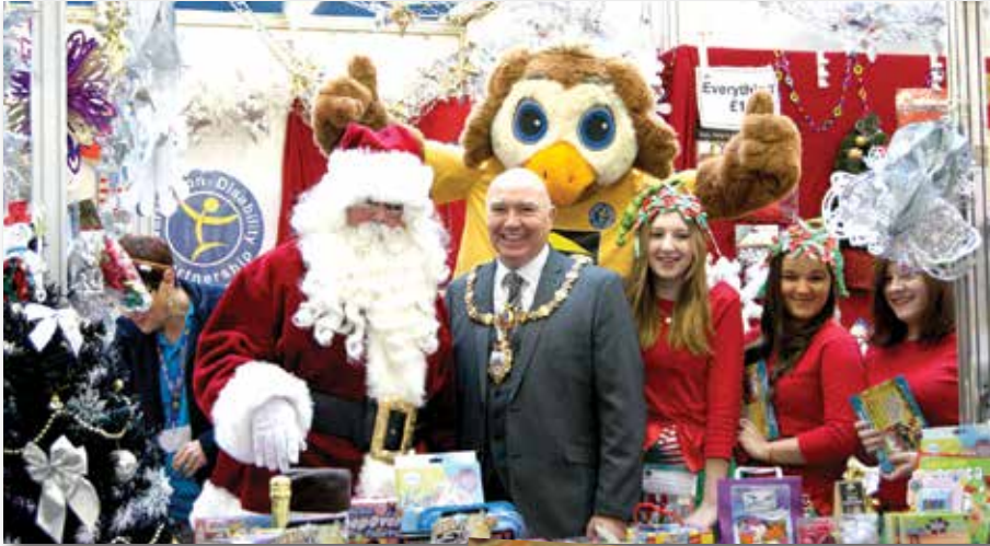
Above: Santa and his elves take a break from the Grotto

Those of you who are seasoned veterans when it comes to these challenges, we thank you for your support and we look forward to doing it all again next year!