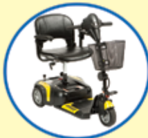
Refurbished Scooters From £199