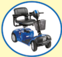
New Scooters From £419