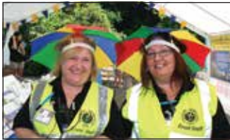
Keeping cool in the heat

The Minister responded admitting it was difficult times with some difficult decisions but she would listen to peoples' concerns.