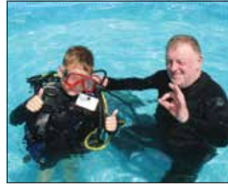
The perfect way to keep cool