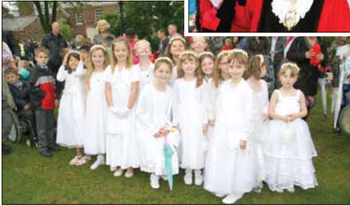
Youngsters from St Benedict's Church