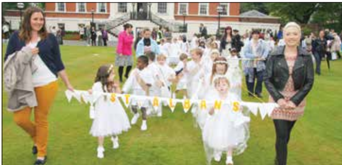
Youngsters from St Alban's Church

For more pictures and video coverage go to www.warrington-worldwide.co.uk