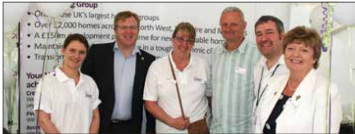
Main sponsors Your Housing