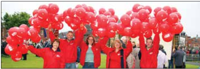
Lift off with Christian Aid