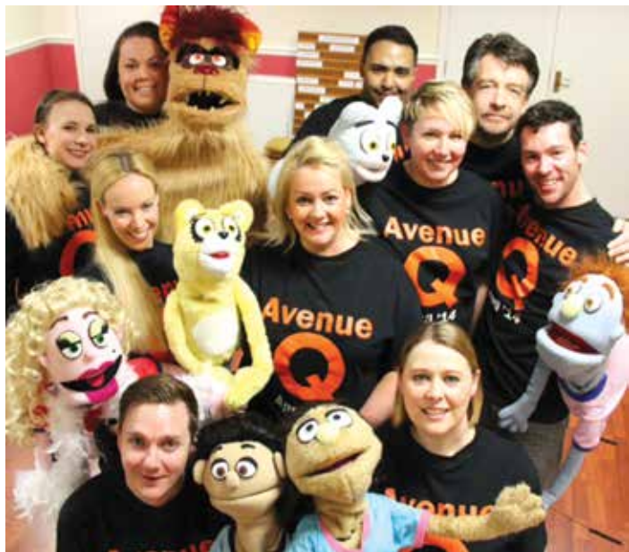
Some of the cast – human and furry!

THREE members of a Warrington family who have been performing on stage since an early age are to appear together for the first time.