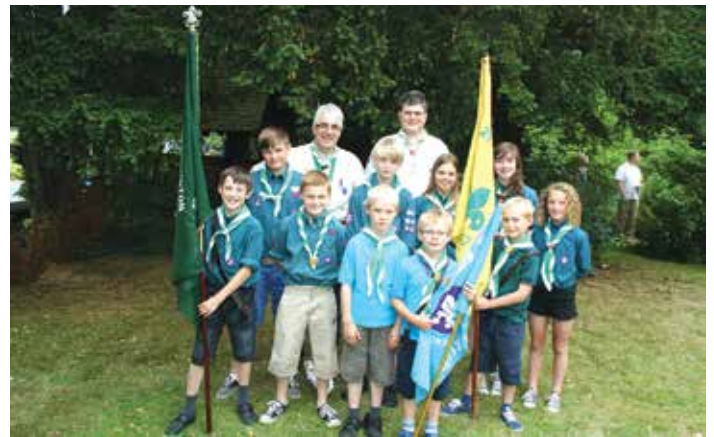
The 21st Warrington Scouts, Cubs and Beavers prepare for the walk