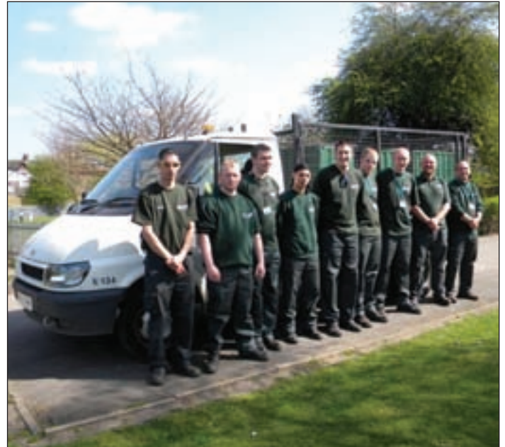
The 'green team' at Alexandra Park

"The staff and friends who contributed to this award thoroughly deserve to be rewarded in this way."