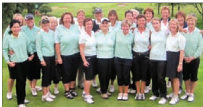
■ The winning team with their caddies on the day.