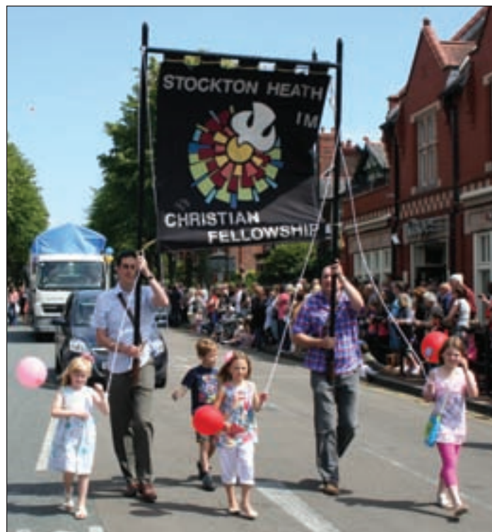
■ Stockton Heath Walking Day.