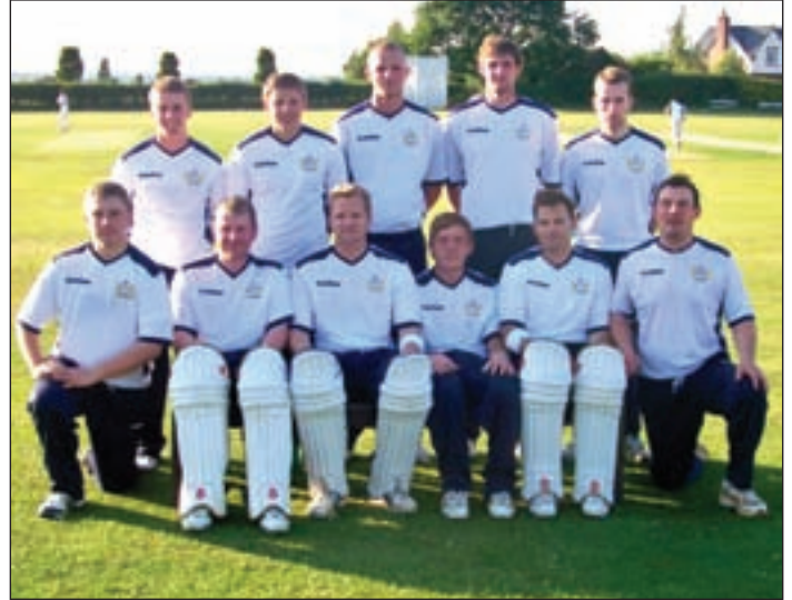
Next season will be a new and exciting challenge with both 1st and 2nd XIs competing in the Premier League.

Over the season Grappenhall have played a lot of attractive cricket, and in an after match speech from the skipper, he thanked the whole squad for their support and contributions.