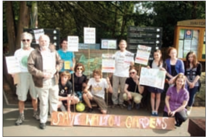
Some of the advisory group and campaigners

The group will be providing opportunities throughout its deliberations for members of the public to express their views and submit their ideas for the sustainable future of the Hall, Gardens and associated buildings.