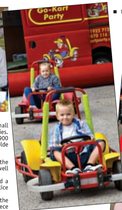
■ Youngsters enjoying the go-karts.