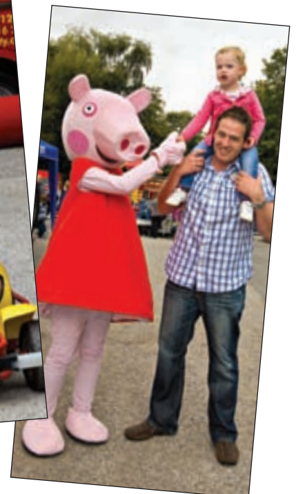
■ Peppa Pig welcoming a young fan.