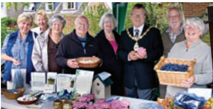
■ The Mayor with the Grappenhall Walled Garden team.

ATTRACTIONS ranging from paintings to paella were on offer at Grappenhall Community Centre's Village Fete which helped provide a boost for local charities. Crowds of people turned up throughout the day and helped raise more than £900 which will go towards improvements in the sports hall and the kitchen of the Olde Barn.