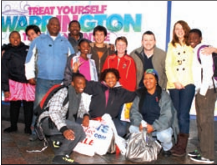
Members of the South African party, with some of their hosts, enjoying a visit to Warrington.