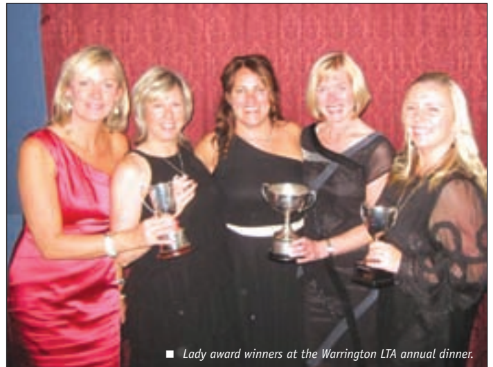
■ Lady award winners at the Warrington LTA annual dinner.