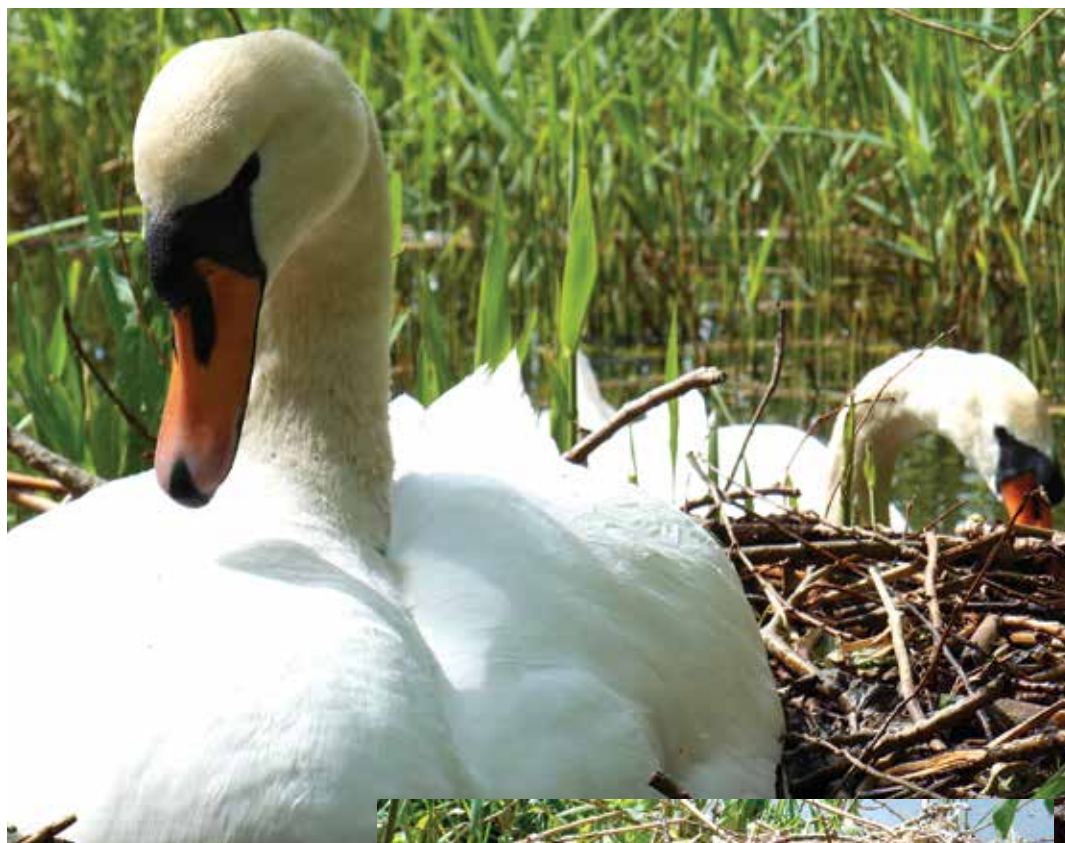
■ The female on the nest with the male behind (above) and the empty nest on the morning after (right).

"God knows what they have done with them. It is too upsetting to think about. I rang the RSPCA to check first whether they had been and taken them for some reason, but they hadn't. It is devastating that someone has done this to such beautiful animals and left the female swan there heartbroken at losing not only her babies but her partner too.