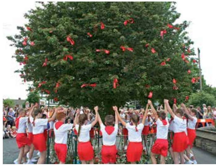
Appleton Thorn Primary pupils performing the Bawming Dance.