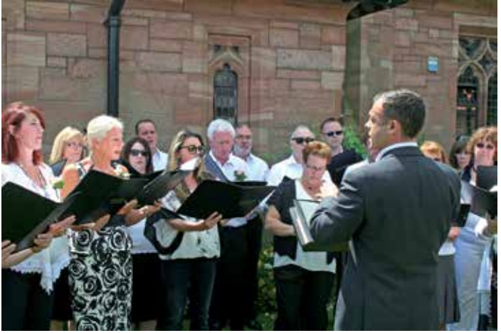
Appleton Thorn Village Choir.