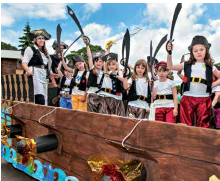
Second Rainbow Guides with their Pirate's Gold float.