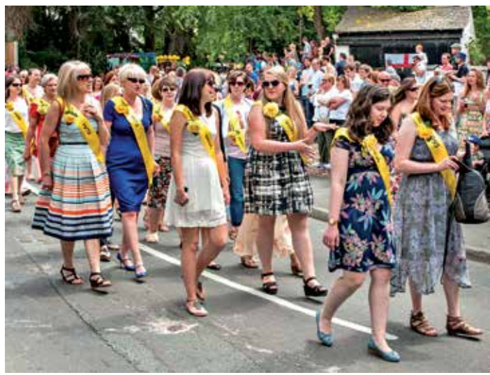
Past Thelwall Rose Queens taking part in the 50th Rose Queen Parade.