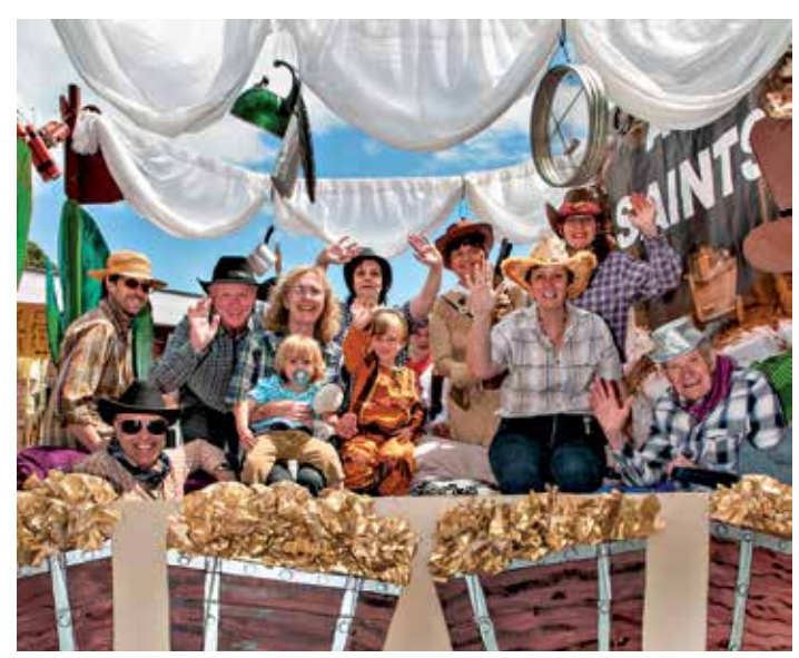
All Saints Parish Church Gold Rush float.