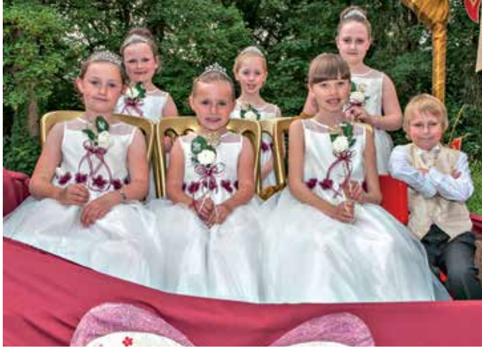
Thelwall Rose Queen 2014 attendants.