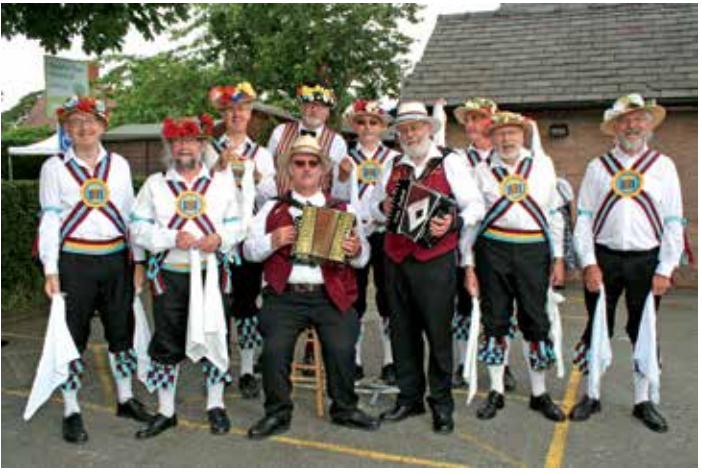
Thelwall Morris Dancers.