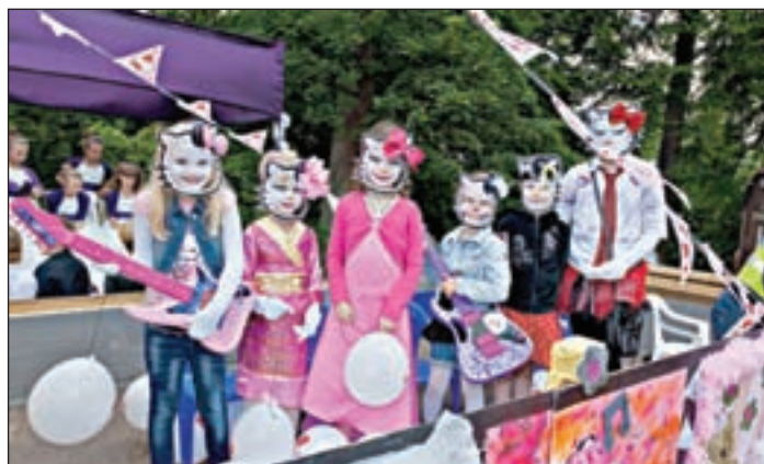
■ Second Thelwall Rainbows and their Hello Kitty float