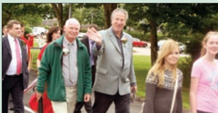
■ MP David Mowat waves to the crowds