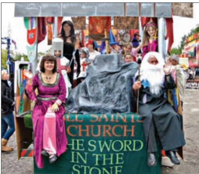
■ The Sword and the Stone was the theme of All Saints Church float