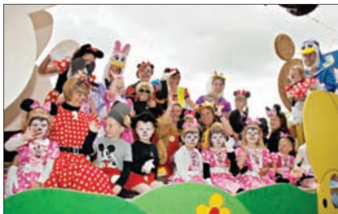
■ The Tugboats Pre-School and their Mickey Mouse Clubhouse float