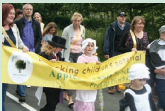
■ Youngsters from Appleton Thorn Pre-school