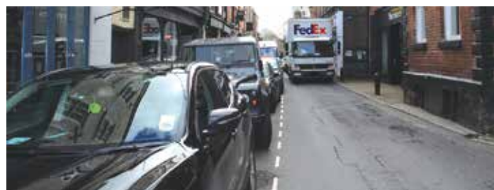
Above: King Street as it is now and below as it will be.

Pictured: The narrow pavements of King Street – and an artist's impression of how they will look.