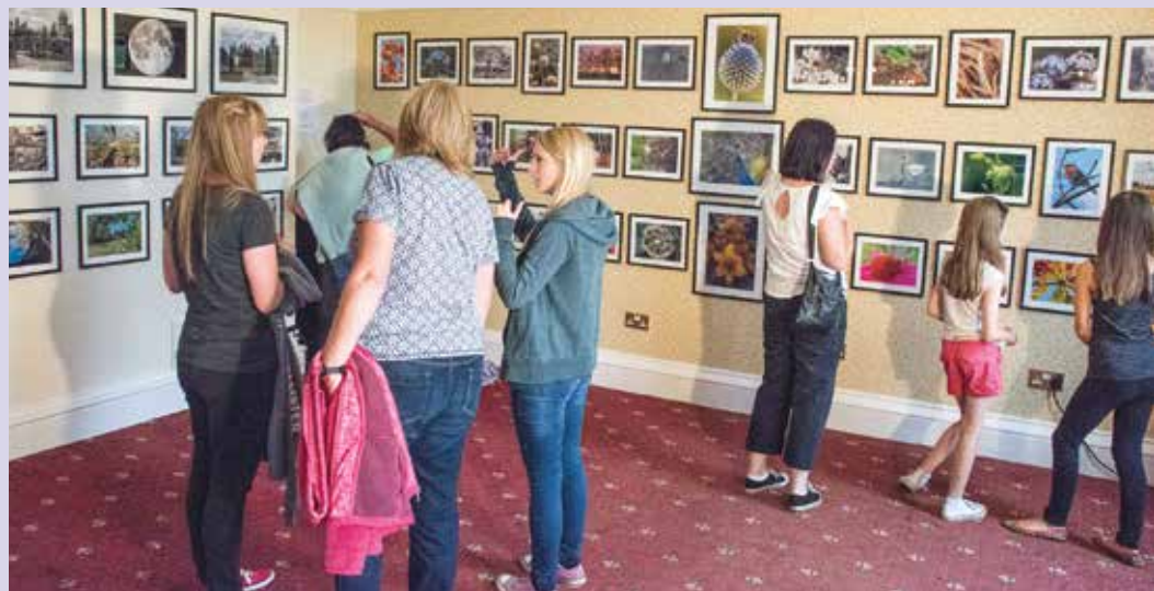
■ The exhibition at Walton Hall & Gardens.

"Although I have, and will continue to travel around the world recording and interpreting what I see, I have taken many many good subjects here in Warrington."