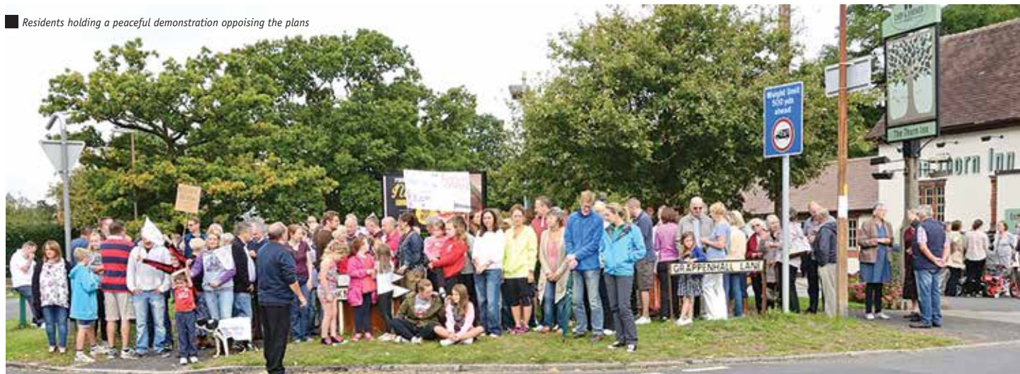
Residents holding a peaceful demonstration opposing the plans