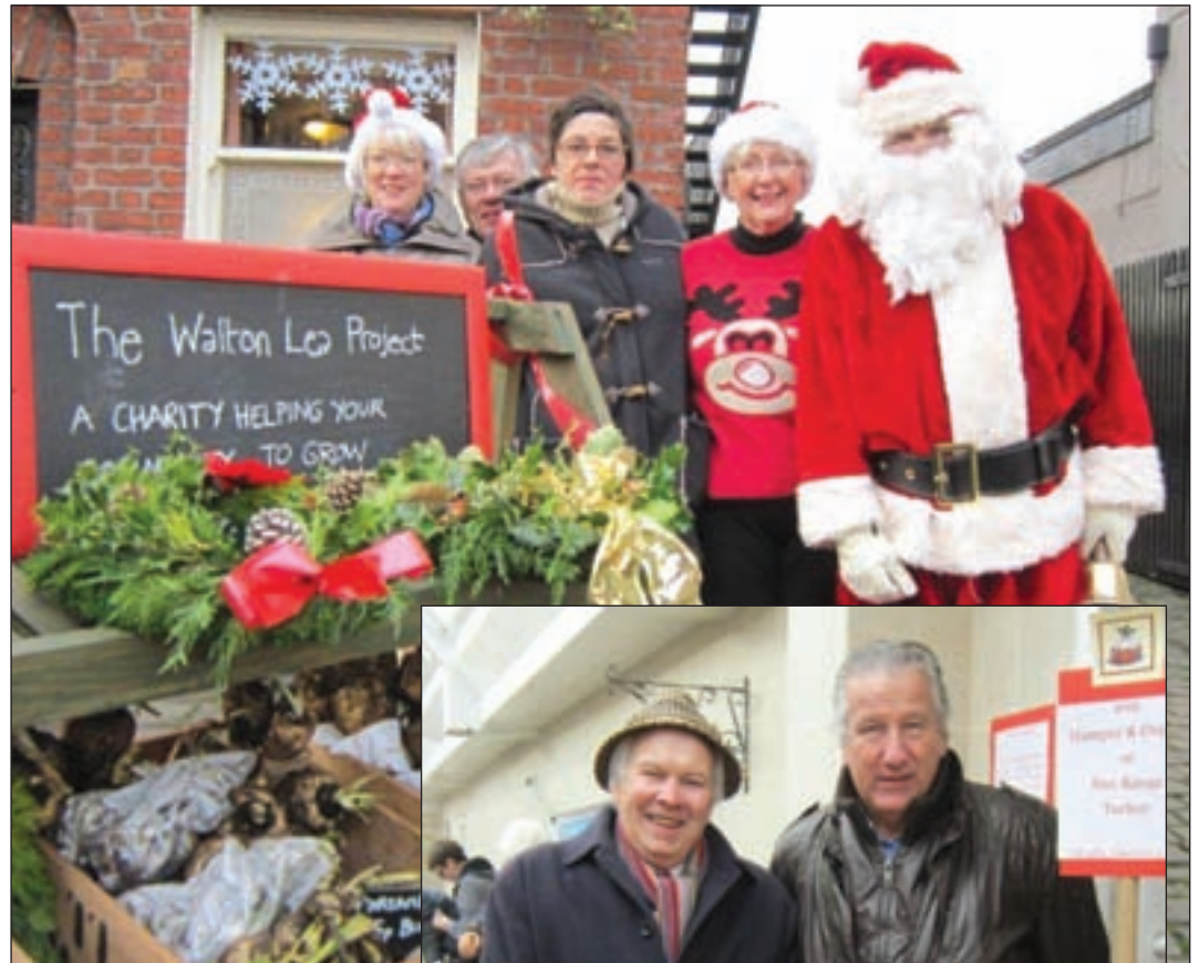
charities to receive funds from the day are Walton Lea Project, Grappenhall Heys Walled Garden, Rotary Club of Warrington and Blooming Boteler the Friends of Sir Thomas Boteler C of E High School.

Money raised will go towards Stockton Heath Festival next year which will be from June 20 to 23. Other