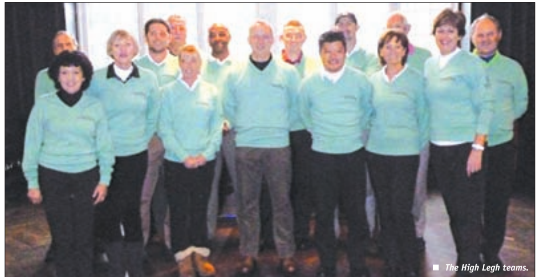
■ The High Legh teams.

MEN'S and Women's teams from High Legh Park Golf Club reached the final of the National Golf Club Challenge, in support of Help for Heroes.