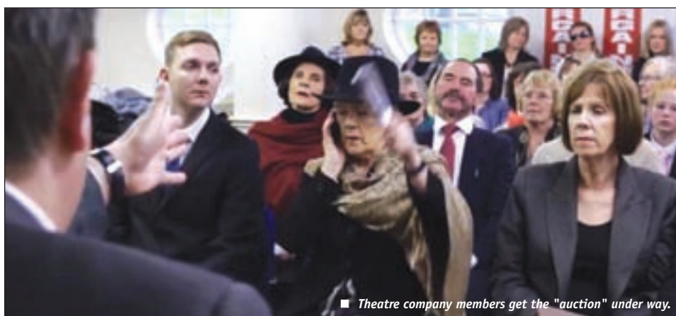
■ Theatre company members get the "auction" under way.