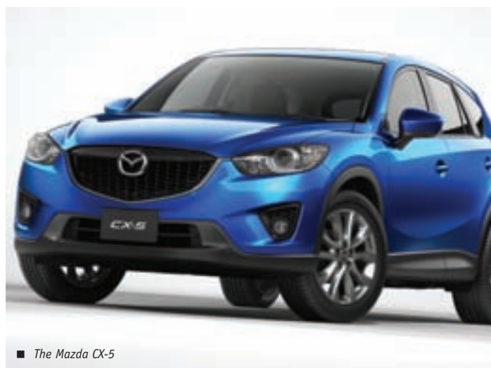
■ The Mazda CX-5

The CX-5 is also an extremely practical crossover, with a 503-litre boot and rear seats which fold flat into the floor at the touch of a button to provide a 1,603-litre load area. During the coming year, Skyactiv technology will be introduced in a whole new generation of Mazda cars.