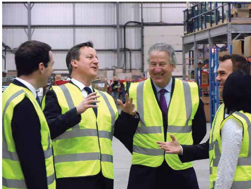
■ Prime Minister David Cameron with George Osborne and David Mowat at the Hut Group's Stretton premises.

The new premises will consolidate The Hut's four existing UK distribution units. They will be used to satisfy both domestic and rapidly growing international operations.