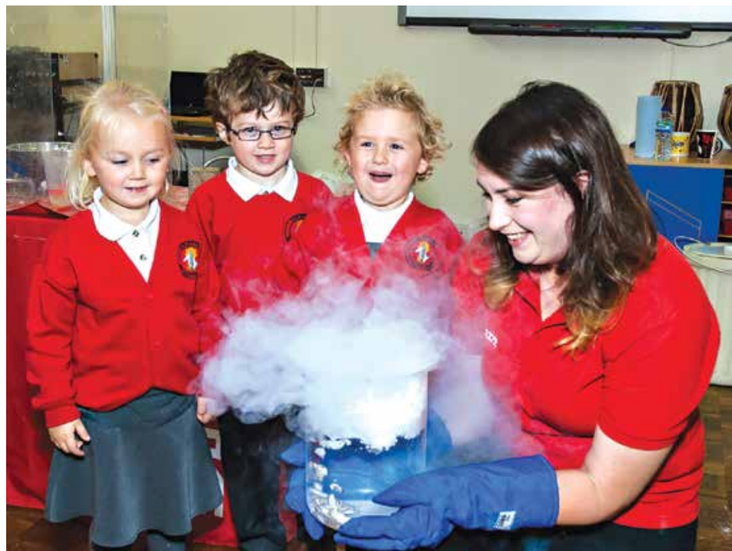
THE prize for St. Matthew's CE Primary School Stretton for winning a Christmas Card competition for North West Primary Schools was a Science Day at their school by the London Science Museum.