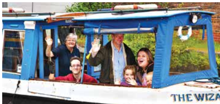
Festival goers enjoy a trip on The Wizard canal boat.

In the meantime, the festival's annual Christmas Market is scheduled for Sunday, December 1 at The Forge Shopping Centre.