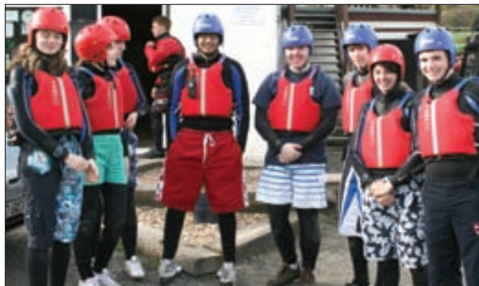
Some of the students all kitted out for body boarding.

MORE than 30 students and three teachers from Appleton College - the sixth form at Bridgewater High School - went on an action packed trip to a residential centre on Anglesey.