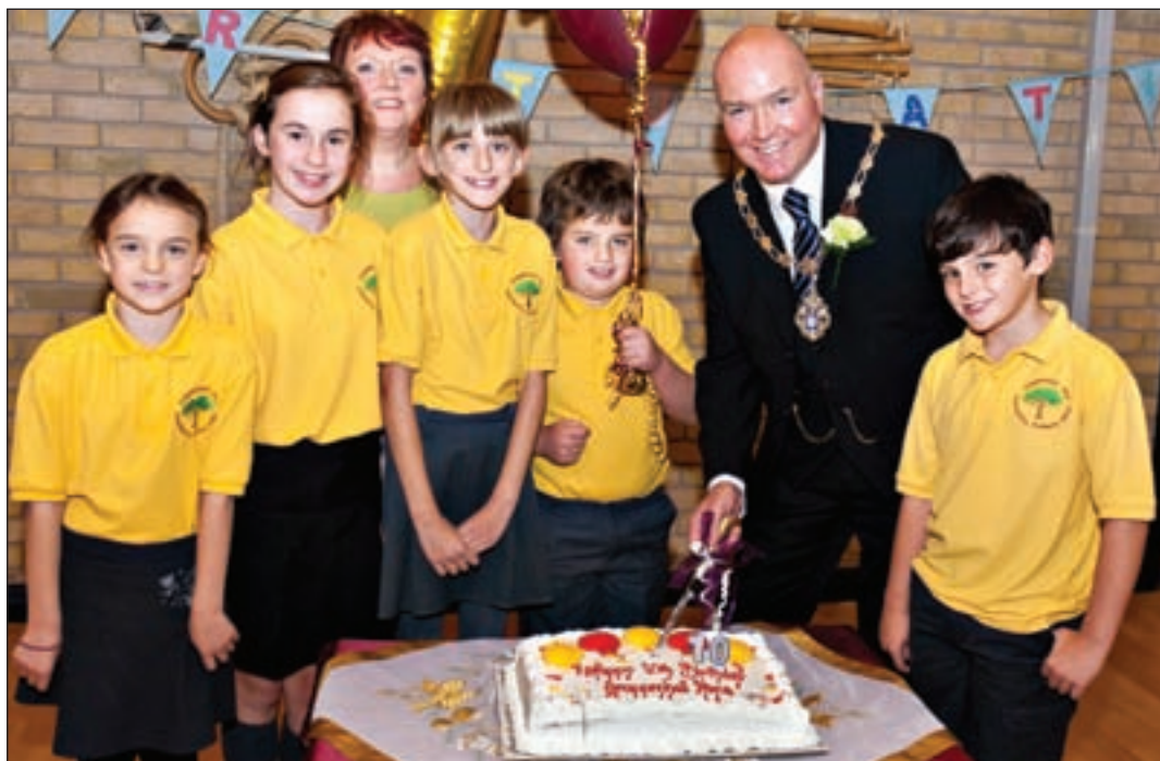
Grappenhall Heys Community Primary School celebrated its 10th Birthday with a school concert and Birthday Cake.