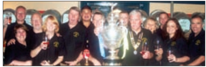
Rotary members with the Challenge Cup.

DESPITE the recession the annual Grappenhall based Warrington Rotary Club Oktoberfest proved to be a great success, raising an estimated £15,000 for local charities and good causes.