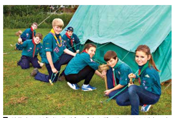
4th Warrington 1st Stockton Heath Scouts Parkgate HQ putting up a tent at their camping demonstration.