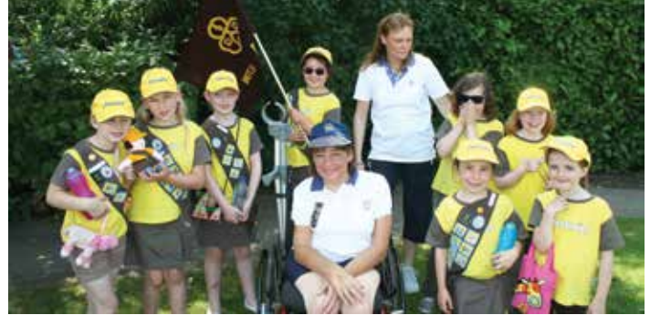
1st Higher Walton Brownies.