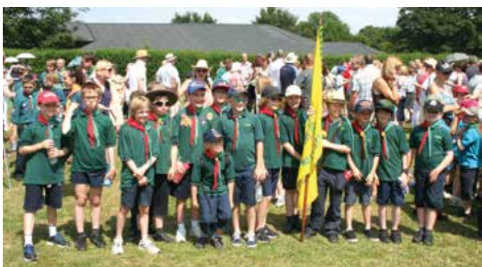
Stockton Heath Scouts.