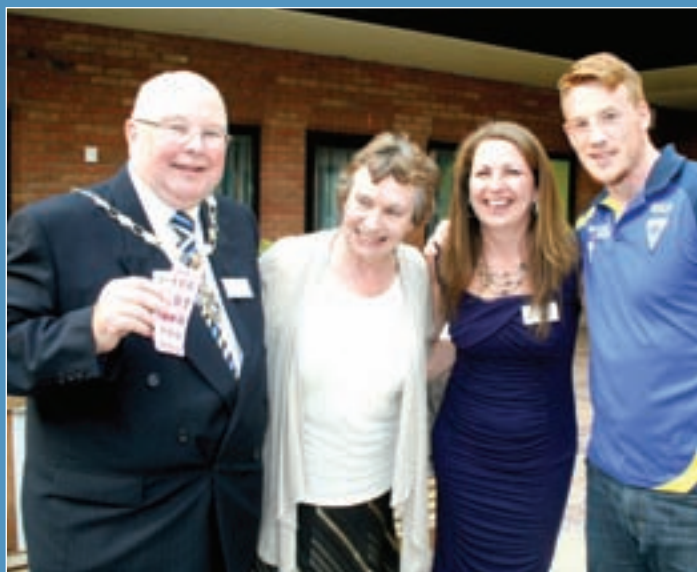
ADELE Carr Financial Recruitment is celebrating 10 years of providing local independent financial recruitment consultancy to accountancy practices.