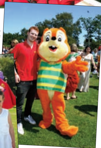
■ The team from Apple Jacks