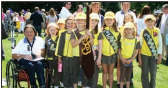
■ 1st Higher Walton Brownies