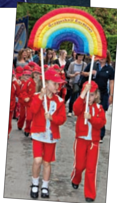
■ Grappenhall Rainbows