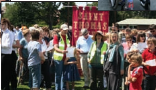
■ Crowds singing on the playing field