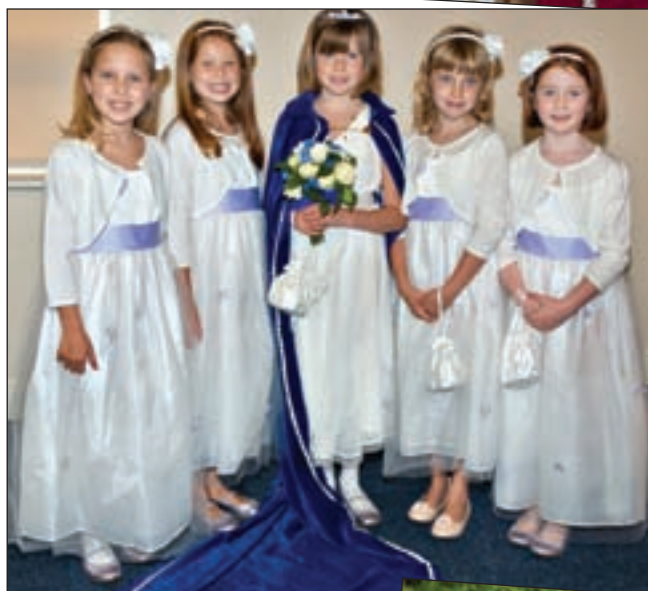
■ Rose Bud 2011 & Attendants