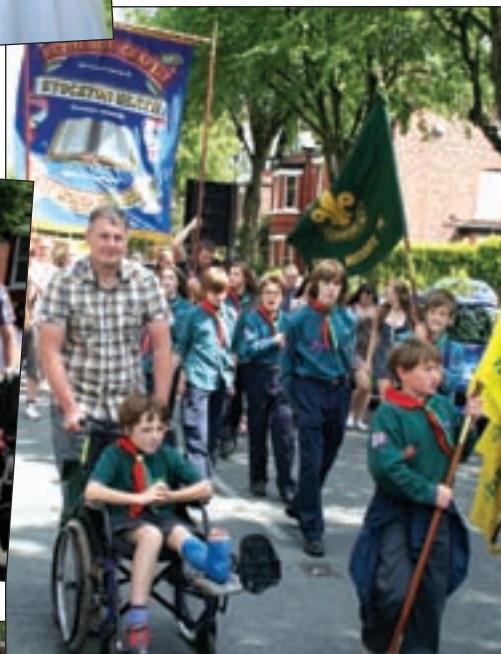
■ Bethesda Chapel and one determined walker!