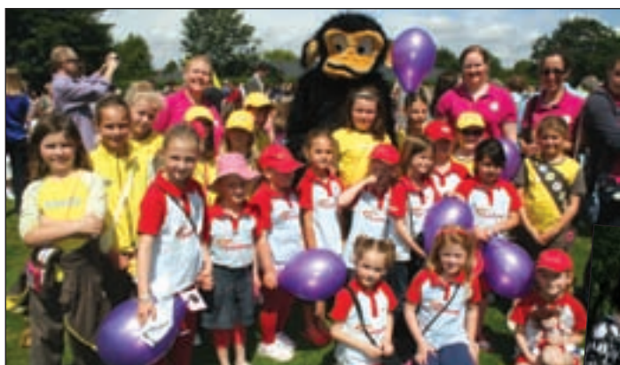
■ 1st Stockton Heath Rainbows and Brownies