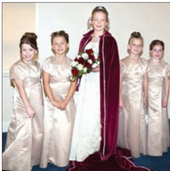
■ St Wilfrid's Rose Queen 2011 & Attendants