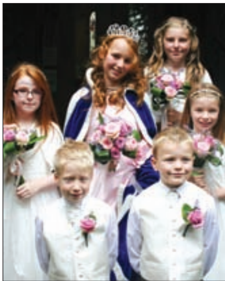
■ Retiring queen and attendants