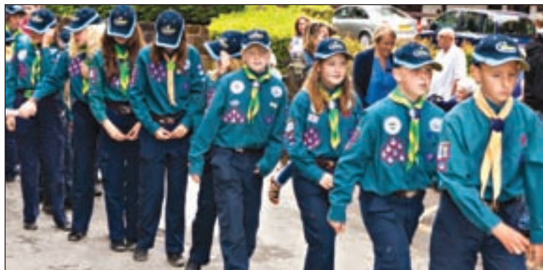
■ Grappenhall Scouts

Hundreds lined the cobbled streets to watch the walk followed by various activities on the school playing fields.