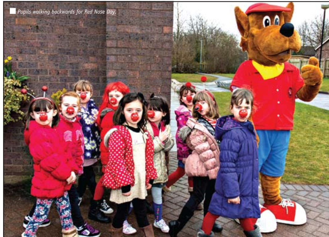
■ Pupils walking backwards for Red Nose Day.

PUPILS from St Matthews' CE Primary School, Stretton were backward in coming forward when it came to thinking up ways of raising money for Comic Relief on Red Nose Day.