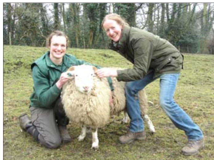
born at Tatton will be on show around this time next year.