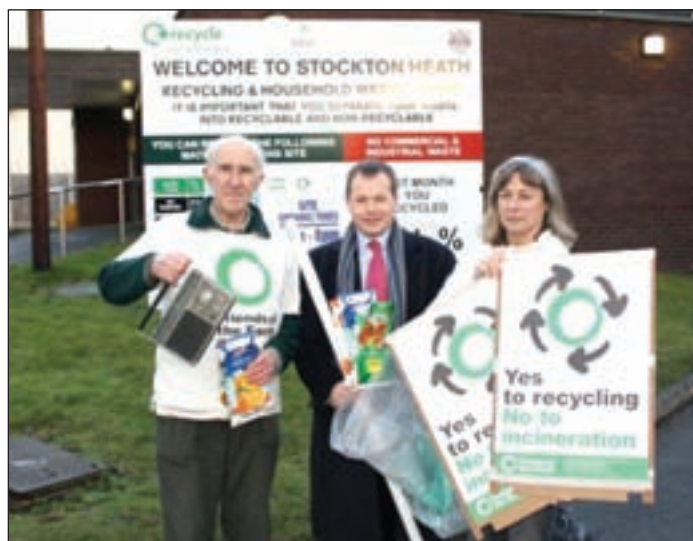
Campaigners at Stockton Heath

They have campaigned for years for the tip to be closed, but the absence of a suitable alternative site to serve the south of the borough has meant the site has stayed open.