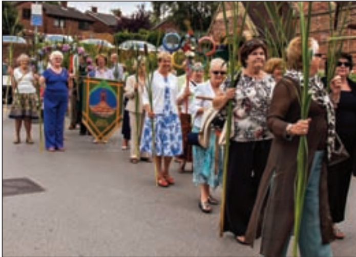
Procession leaves Pepper Street.