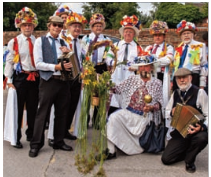
Lymm Morris Men group.