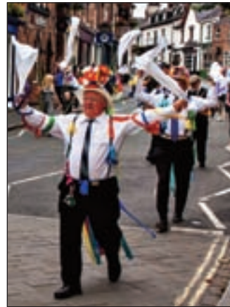
Lymm Morris Men dancing in the procession.