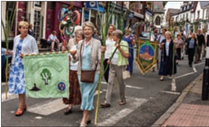
Lymm Jubilee W & Lymm WI in Procession.