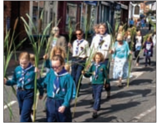
Parading through the village.