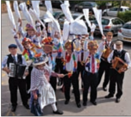
Thelwall Morrismen prepare for the event.