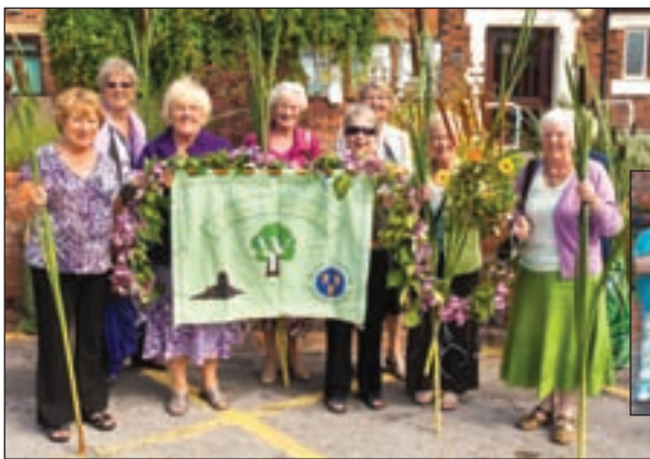
Community groups and organisers.