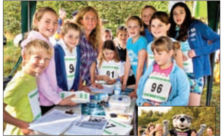
Above: Children registering for the run.