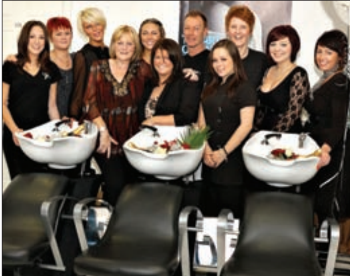
The Look team

Meanwhile training nights take place on a Tuesday night for junior stylists and models are needed for all services at a very discounted rates.