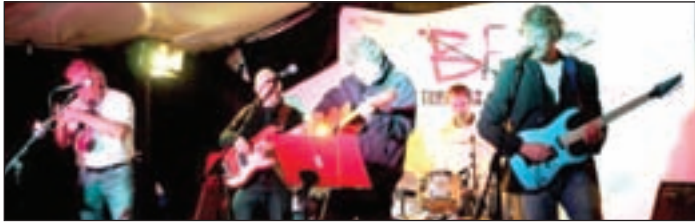
Two's Company performing as 4's A Party