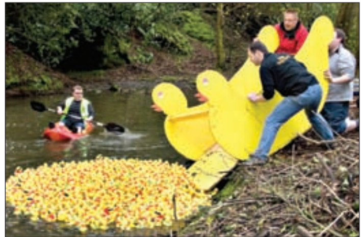
There off! Members of Lymm Roundtable release the ducks