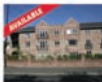
76 Great Oak Drive, Altrincham £750pcm