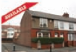
155 Gorsey Lane, Warrington £575pcm