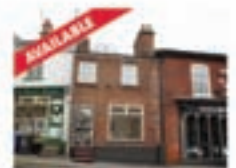
20 The Cross (commercial) £1,500pcm