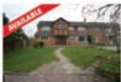
Corn Heyes Cottage, Lymm £1,395pcm

Due to current demand, rental property stocks have reached very low levels! If you are considering letting out your property or you are finding it difficult to sell, please pick up the phone or drop into our office above the coffee house when you are in the village. Our team are here to help.