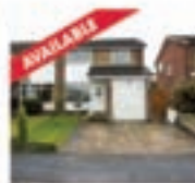
1 Mardale Crescent, Lymm £895pcm