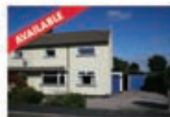
Booth Hill Road, Lymm £795pcm