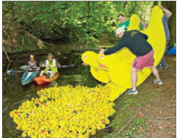
They're off! Ducks are tipped into the Lower Dam