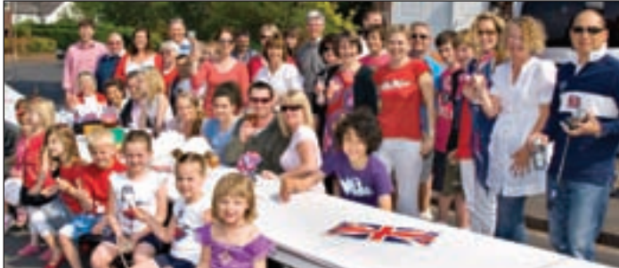
Residents of Hardy Road, Lymm, were one of only six official street parties taking place across the borough.