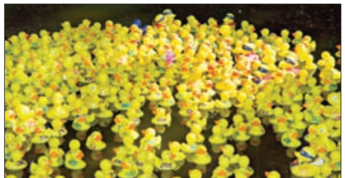
The ducks go slow!