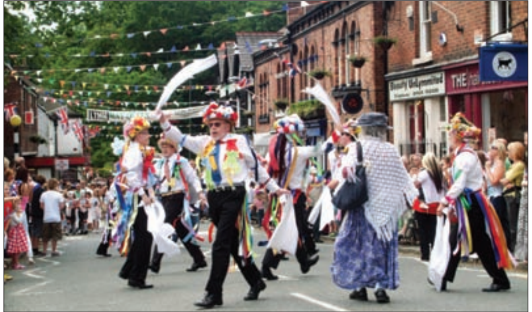
Morris dancers at last year's event