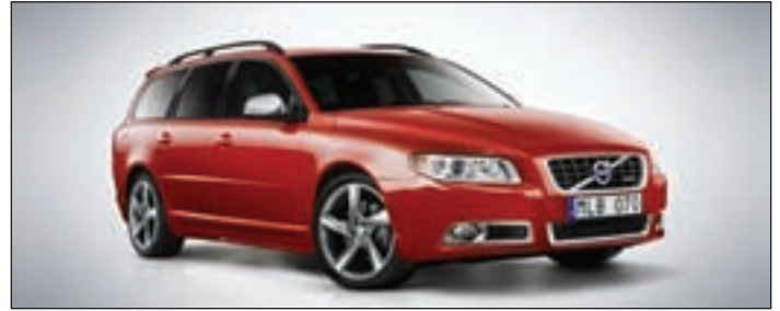
The V70 R-Design estate car

Both cars feature the latest Volvo Sensus infotainment system, all information presented on a five or seven-inch colour screen positioned to make it easy for the driver to keep his or her eyes on the road.