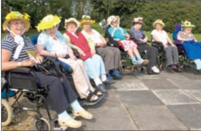
COTEBROOK Day Care Centre organised a special Easter Bonnet parade for residents.