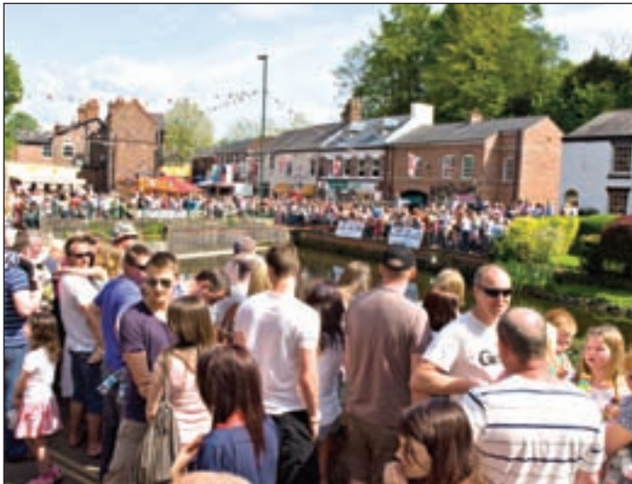
Crowds gather in the village centre